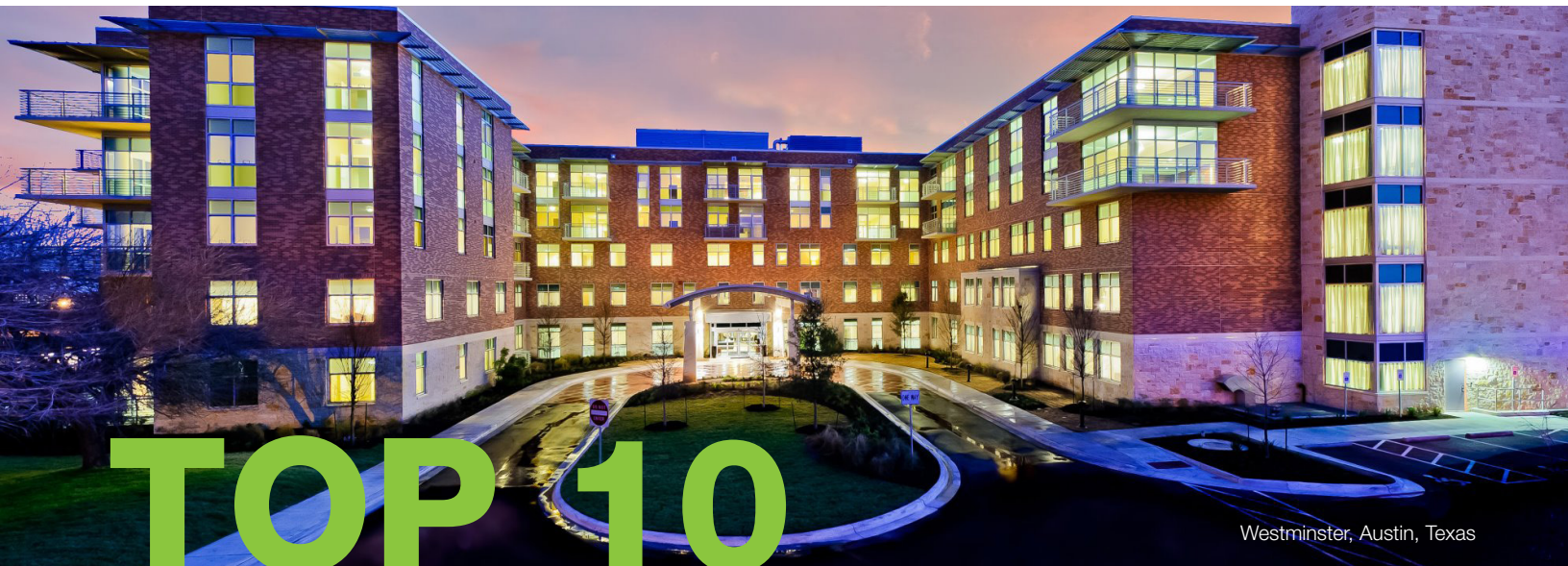
Westminster, Austin, Texas